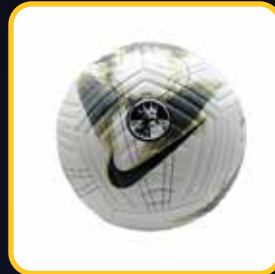
PREMIER LEAGUE PITCH 2023/24