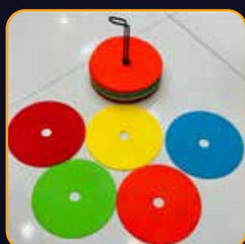
FLAT CONES 25 PCS SET