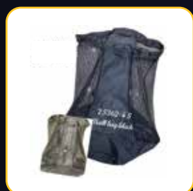
BALL CARRY BAG