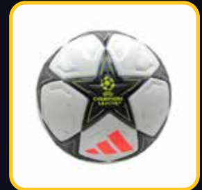
UCL PRO 24/25 LEAGUE PHASE BALL