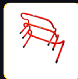
HURDLES PVC 15CM, 23CM, 30CM