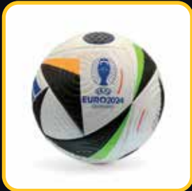
EURO PRO BALL 2024