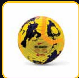
NIKE PREMIER LEAGUE CLUB ELITE