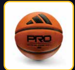
ADIDAS PRO BASKETBALL

EXPLORE THESE & MORE AT www.xen-store.com