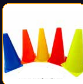
MARKING CONES 18CM, 23CM, 32CM