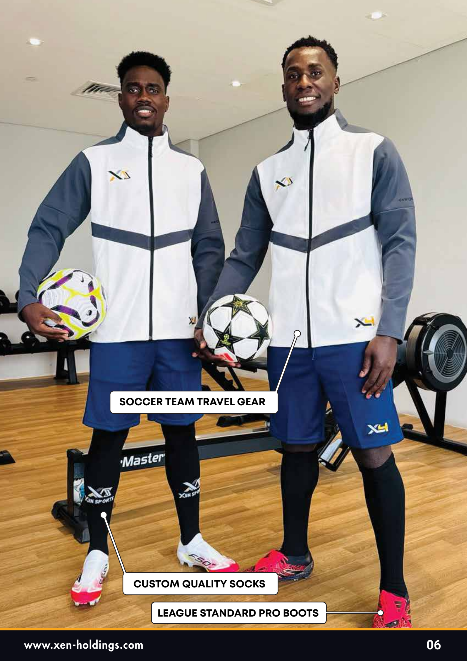
SOCCER TEAM TRAVEL GEAR