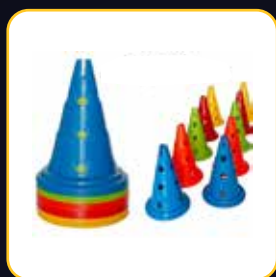
CONES WITH HOLE 52CM