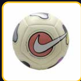
NIKE MAESTRO FUTSAL BALL