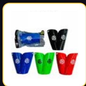
SHINGUARD KIDS 13 CM