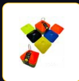
TRAINING DISC CONE