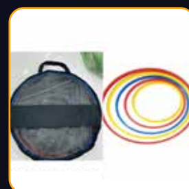
TRAINING RINGS WITH BAG