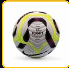
NIKE PREMIER LEAGUE PRO FLIGHT