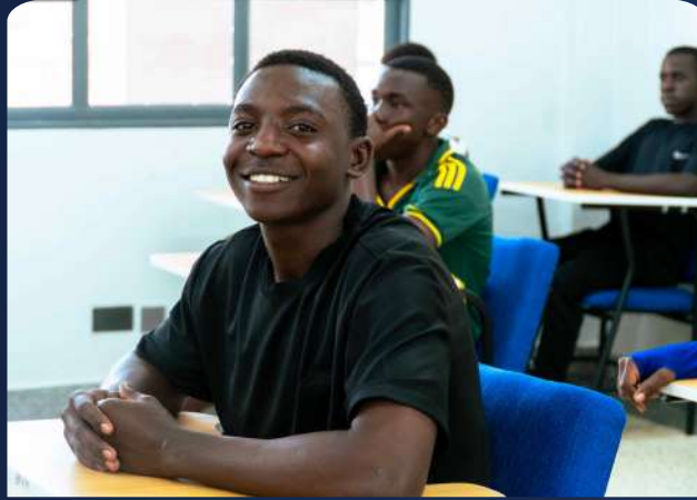
EDUCATION FIRST POLICY