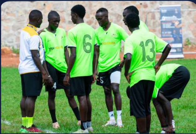
360° PLAYER SUPPORT (ON & OFF THE BALL)