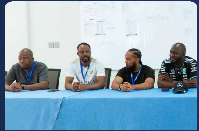
INTERNATIONAL DEVELOPMENT PATHWAYS