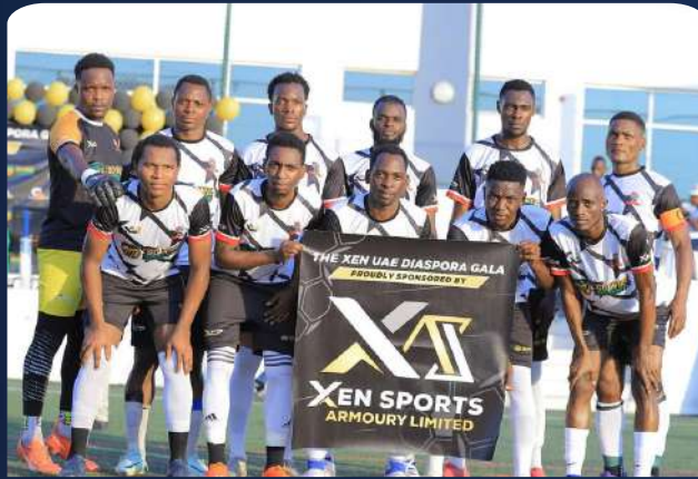
LOCAL & REGIONAL TRIALS / EXHIBITIONS