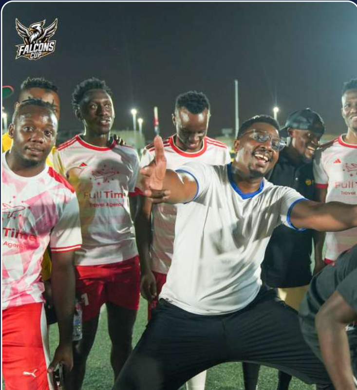
WINNERS OF THE XEN FALCON CUP