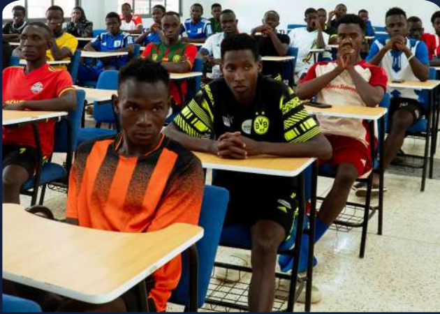
1-3 YEAR STRUCTURED PROGRAMME